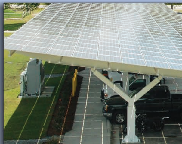
Shade Parking and Charging Station.

ABCOSOLAR is a licensed (K-11) electrical contracting & solar installation company with an experienced team of installers, engineers, and electricians. We offer professional installation of quality manufactured photovoltaic (PV) modules for residential, commercial and industrial applications. ABCO Solar will provide every aspect of your installation, including system sizing, equipment selection, design, permitting, System Design for Homeowner Association Review , financing and provide tax information.