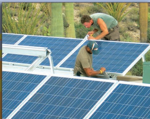
Rooftop Photovoltaic Panels Capturing the Arizona Sun.

CALL US TODAY FOR A Start saving money (and reduce your carbon footprint) with a clean, money-saving, long-lasting photovoltaic system. FREE ESTIMATE