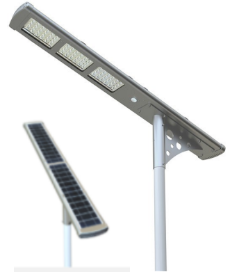
SL-4 and SL-8